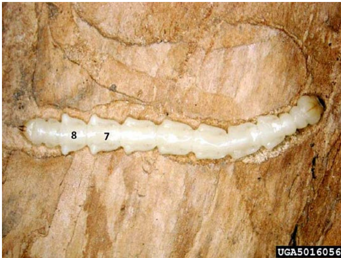
Figure 5. Bell-shaped abdominal segments distinguish the larva.