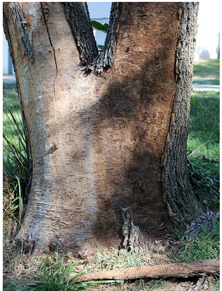
Figure 1. Emerald ash borer infestation.

Early national media reports of EAB activities raised little concern in Kansas, mainly because of the vast geographic buffer separating the state from the waterways where the pest was first established. In 2008, EAB was confirmed at Lake Wappapello State Park in southeast Missouri, only 237 miles from the Kansas town of Galena, which prompted federal and state agencies to monitor for EAB in Kansas. With no detections further west for several years, Kansans remained relatively complacent until July 2012 when authorities announced the discovery of EAB in Parkville, Missouri, which borders Wyandotte County. Based on damage to the infested tree, it was estimated that EAB had been present for 6 to 8 years.