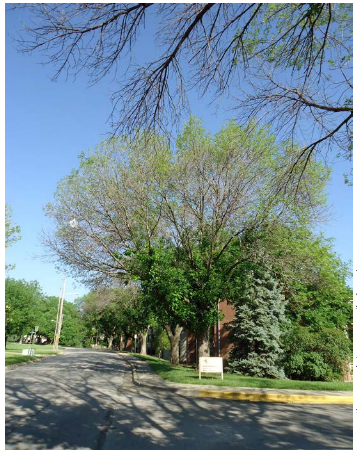
Figure 7. Irreversible damage in the tree canopy.

The best candidates for preventive treatments are trees that appear healthy and do not show signs of borer activity such as a thin canopy, dying branches, water sprout growth, bark splits, D-shaped beetle emergence holes and woodpecker damage. Unfortunately, these abnormalities become evident only after several years of feeding by emerald ash borer larvae. Trees showing these signs of irreversible damage are less likely to be saved.