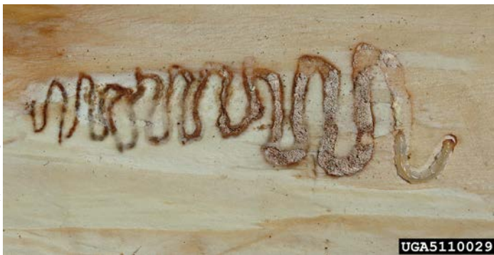
Figure 6. S-shaped gallery widens as the larva grows.

before depositing eggs in bark cracks and crevices. After hatching, larvae bore through the bark to feed and develop in the sapwood. By October or November, mature larvae cease feeding. They create an overwintering chamber, then transform into the overwintering prepupae.