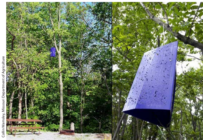
Collin Wamsley, Missouri Department of Agriculture

Since 2008, USDA's Plant Protection and Quarantine program and KDA have been participating in a national trapping survey, deploying sticky purple prism traps baited with attractive aromatic lures at detection points in Kansas such as rest areas, nurseries, camping sites, pallet remanufacturers, raceways, forest debris sites, sawmills, and military bases. No emerald ash borers were recovered between 2008 and 2012. In 2013, five beetles were found at four trap sites near the same location: one beetle at site A, two beetles at Site B, and one each at sites C and D.